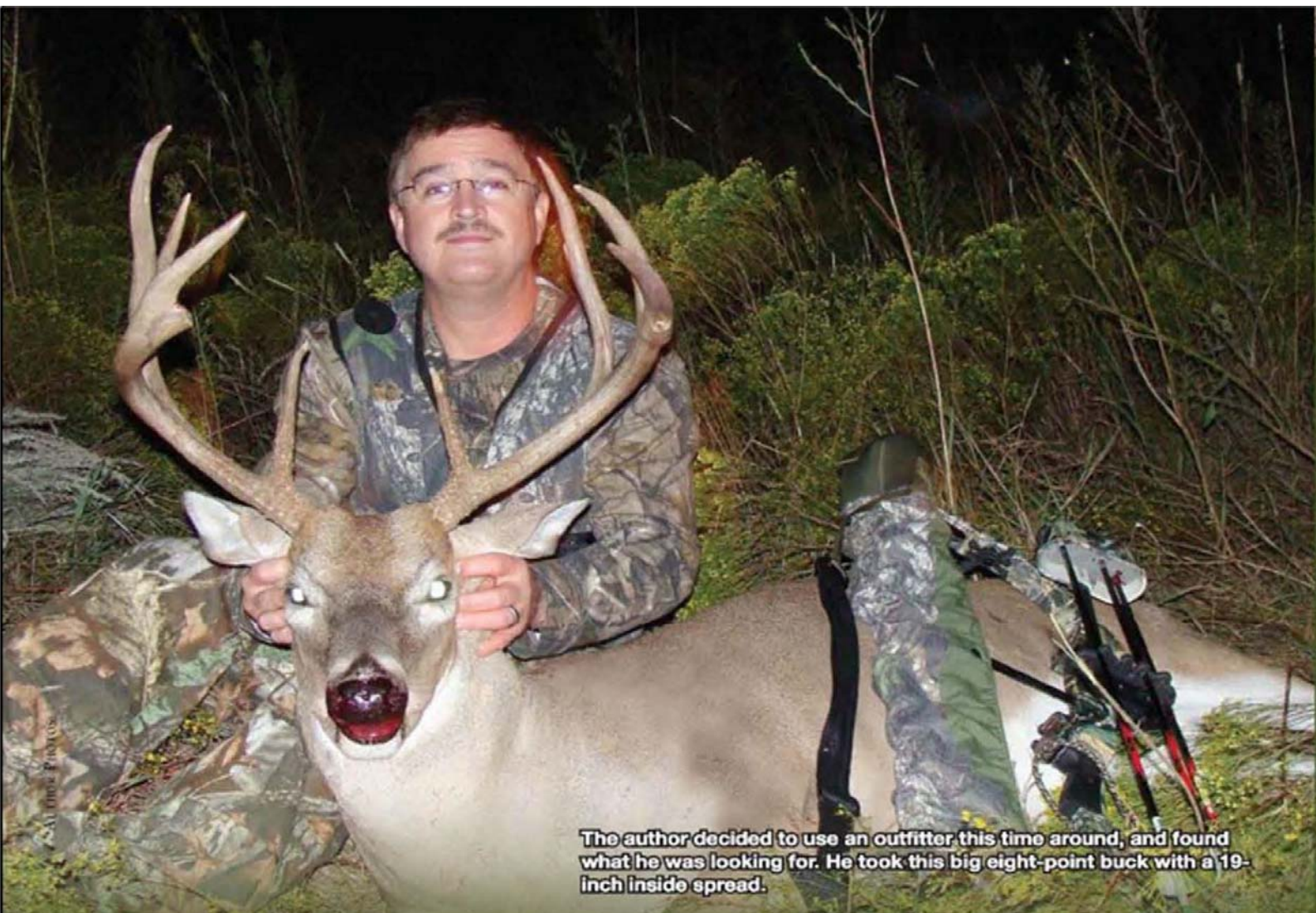
The author decided to use an outfitter this time around, and found what he was looking for. He took this big eight-point buck with a 19-inch inside spread.